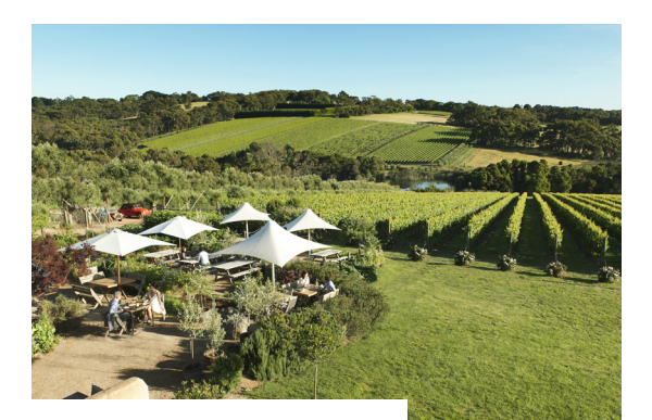
Clockwise from far left: Alba Thermal Springs; Montalto winery; Bushrangers Bay; a spread at Shihuishi.

A drive out to Cape Schanck Lighthouse is a worthy adventure between snacks, but a hike down to Bushrangers Bay is an even better move. Traverse the basalt cliffs where you'll see kangaroos hop, before arriving at a rockpool-lined dramatic beach, on this 5.4-kilometre round-trip trek.