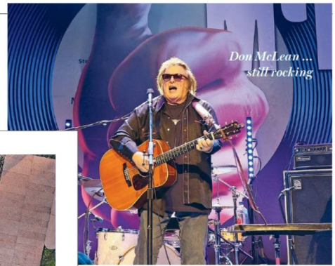
Don McLean ... still rocking